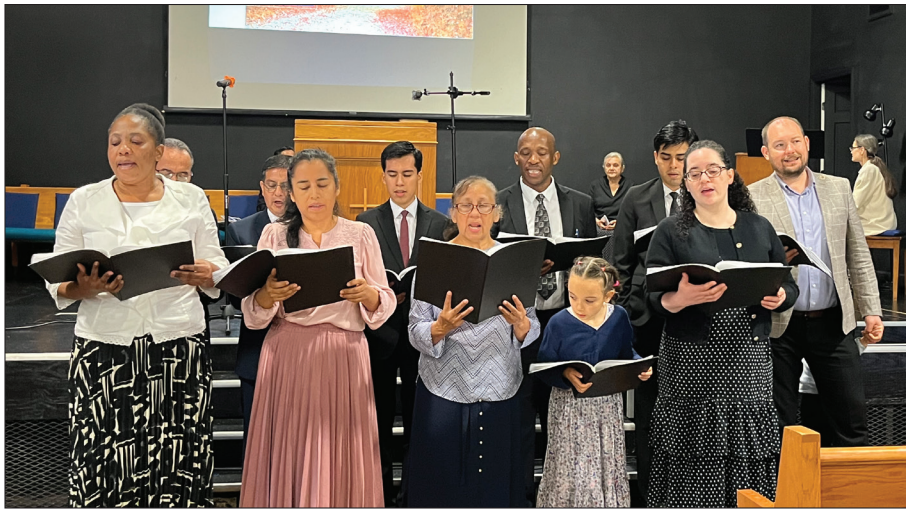
The Cedartown choir sang several special songs.

a joy for the student of world history to see that Biblical prophecy laid out the stages of history ahead of time. We all need to arise, pray, worship, and make God first as we search the prophecies. However, if we are self-sufficient and do not want to learn, we will not recognize what is happening in the last days, when a high degree of understanding is needed. Daniel pleaded for spiritual understanding of the prophecies that he received from God, and his request was granted. The events that are prophesied in Matthew 24 and elsewhere in the Bible will happen quickly and in strange ways; and that is why Jesus said, "Therefore be ye also ready: for in such an hour as ye think not the Son of man cometh." Verse 44.