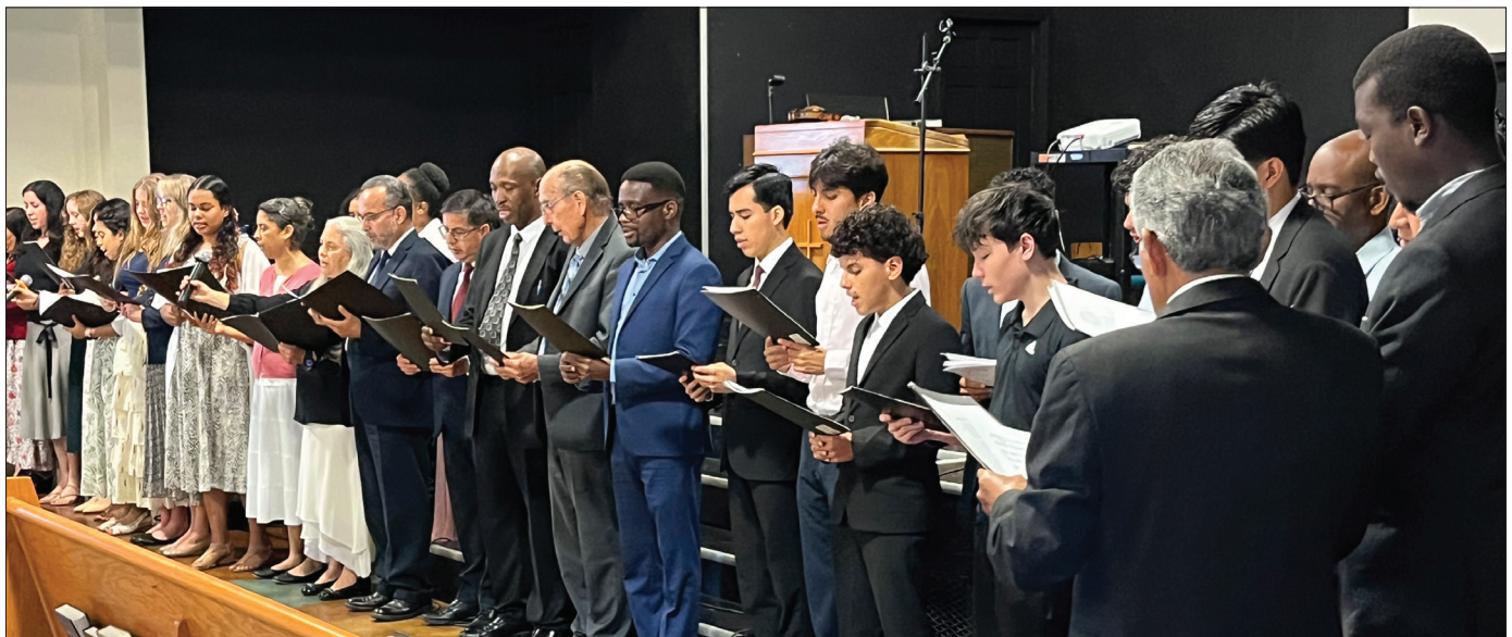
Believers from the local churches and other places combined to form the Southeastern Field choir.