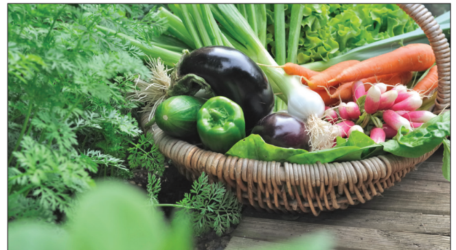
One's own organic garden is a treasure that is blessed by the great Creator!

When you purchase water and food from grocery stores or other suppliers, you generally do not know what you are getting. If fresh foods were harvested before they were ripe and were shipped long distances, it is impossible for them to contain all of the nutrients that support good health. Furthermore, if such foods were produced on commercial farms, where the soil was never allowed to rest and was sprayed with chemicals, instead of being carefully nurtured to produce as many microbes and nutrients as possible, those foods will for sure contain toxic chemicals (and nanoplastics, too!). In addition, processed and ultra-processed "foods" cannot nourish anyone's body, because most of the nutrients have been taken out, while toxic additives overload the body and make it sick!