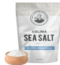
Salt containing no plastics is available.

refined, and cold pressed. There are companies that sell such products. I recently purchased a subscription for "Ava Jane's Kitchen" avocado oil. It is pure and not mixed with adulterated oils. It is estimated that one-third of our calories comes from vegetable oil, so this is a very important aspect of our health!