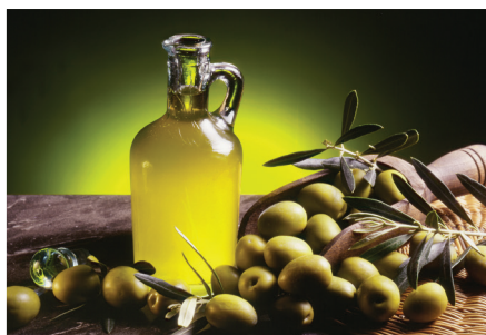
Finding organic, unrefined, cold-pressed olive oil is well worth the effort.

Another important area to know about is seed oils (sunflower, palm, corn, soybean, canola, grapeseed, peanut, safflower) that are processed with heat, pressure, and numerous chemicals to get the oil out of the little seeds, refine it, clean it, remove waxes, bleach it, and remove the rancid odor by heating it to 475 degrees F. Ninety-five percent of cooking oils on U.S. supermarket shelves are so toxic and carcinogenic from this process that they are banned in 19 European countries.