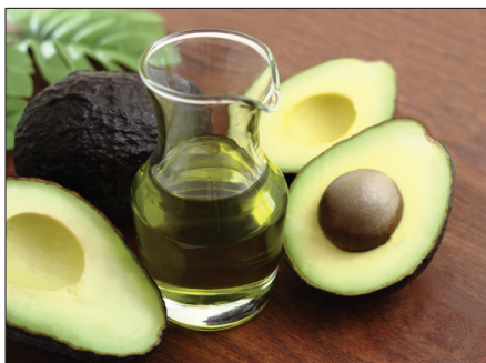
Organic, unrefined, cold-pressed avocado oil is green, highly nutritious, and delicious.

The kidneys and liver are the two filtration systems of the body. However,