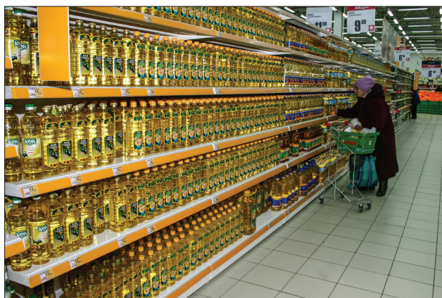
Cheap seed oils processed with high heat and chemicals often dominate the food oils section in grocery stores.

It is urgent that, under the guidance of the Holy Spirit, we adopt a less artificial lifestyle. The more whole and pure our food is, the less we will be affected by the world's dangers. Talk to God about it, because in the long run our lifestyle affects our spirituality and our relationship with Him!