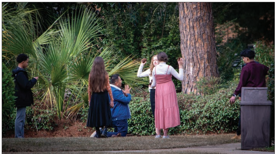
A group of young people acted out a Bible story during the youth conference

After Jesus’ death, resurrection, and ascension, the song of victory rang out in heaven. He was seated on the throne of glory. “Wherefore God also hath highly exalted