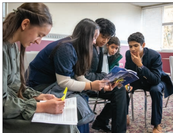
Young people worked together on lessons