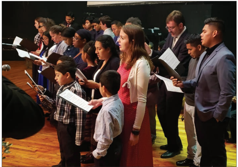
The Northeastern Field choir sang a beautiful song