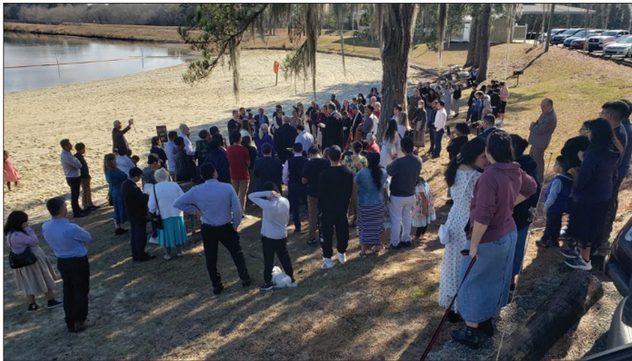
The baptism was held at the beautiful lake in Reed Bingham State Park

surrounded by opulence, intrigue, and deception and were exposed to the greatest possible dangers, they spoke of Christ.