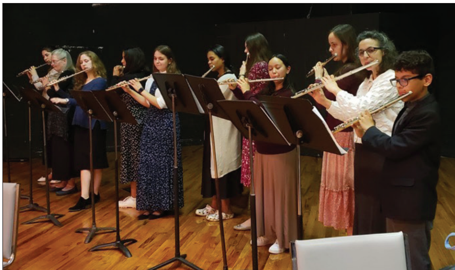
During the concert on Sabbath evening, a flute choir played "When I Come to the End of the Road"