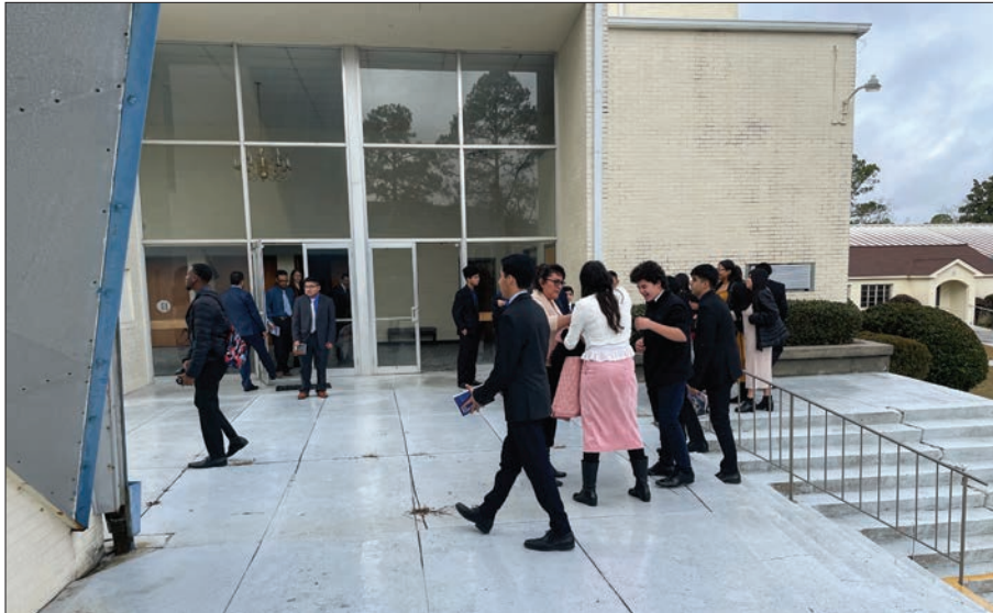
Entrance to the Auditorium, southwest of Love Chapel

The apostle Paul wrote about women who helped him and whose names are recorded in the book of life. Christian