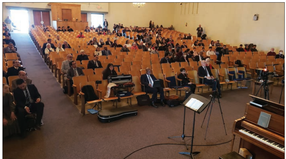
Part of the congregation in the Auditorium

The question is, What is in my heart? How is one changed from being a Pharisee—a whited sepulcher? Matthew 23:27. We need to pray that God will reveal to us what we really are. "Rejoice in the Lord always: and again I say, Rejoice." Philippians 4:4. We tend to be confused because of our own condition, often judging others by their actions. Instead, may the Lord help us to analyze correctly our own experience with our families, neighbors, and fellow believers. It is very easy to fall in this area.