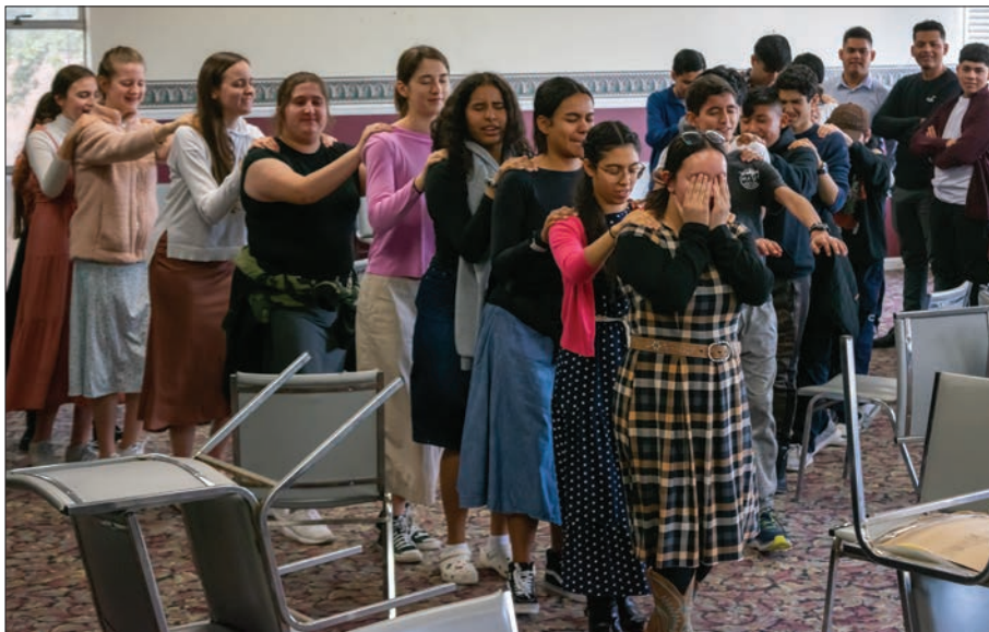
Some young people had a chance to experience blindness in an activity during the youth conference