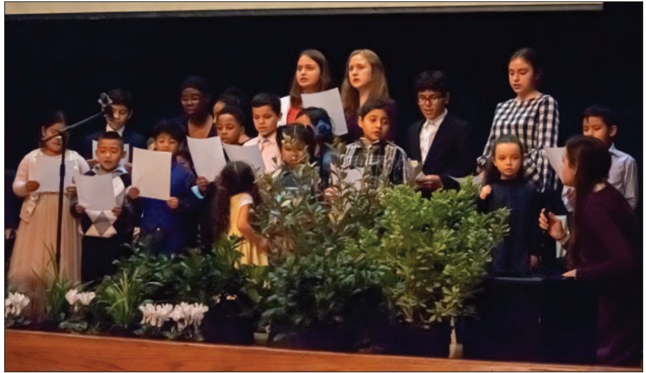
The children's choir was joined by a few young people to praise God with a song

The example of Israel's exodus from Egypt, as well as the obstacles they encountered on the journey from there to Mount Sinai, shows that God wants not only to give liberty to His people but also to perform miracles for them. At the Red Sea and forty years later at Jericho, the Israelites really did not understand the deep meaning of