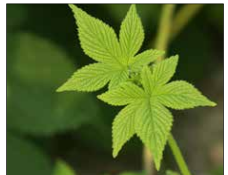
All living things are a revelation of God, who made them both functional and beautiful

And the first of those ten precepts and principles is order. "The law of