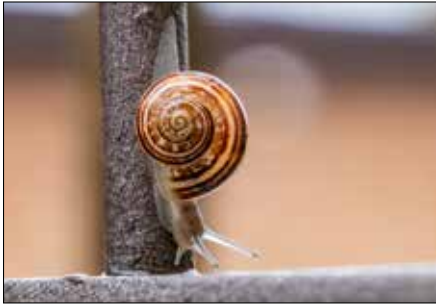
The shells of land snails have the Fibonacci sequence as well

one according to a Fibonacci number. The sequence is the most efficient way to pack seeds or petals into the smallest possible space.