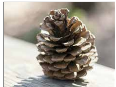
Pine cones carry the Fibonacci sequence

analogy to express the remarkable na- ture of carbon's formation in the uni- verse." — BioLogs , November 20, 2023.