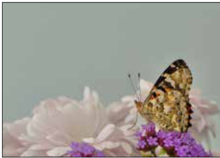
God's order encompasses not only physical beauty but also beauty of thoughts and ideas

"The rabbis, the priests and rulers, had ceased to look beneath the symbol for the truth that was signified by their outward ceremonies.... The moral truth that they presented, which was so significant to the Jewish nation, to a large degree lost its sacredness in their eyes. As they lost sight of spiritual doctrine, they multiplied ceremonies." —Review and Herald , May 23, 1899.