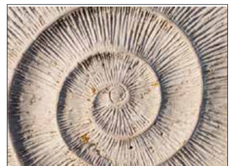
Seashells also contain the Fibonacci sequence

Another marvel is that throughout na- ture there is seen something called the Fibonacci sequence. It is seen in the spiral patterns of plant structures, such as pine cones, sunflowers, and the spi- rals that are seen in the crosscut view of seashells. The sequence is related