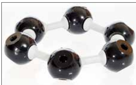
Model of a carbon atom

On day two, the second ordering that He did was to make "a firmament in the midst of the waters... [to] divide the wa- ters ... which were under the firmament