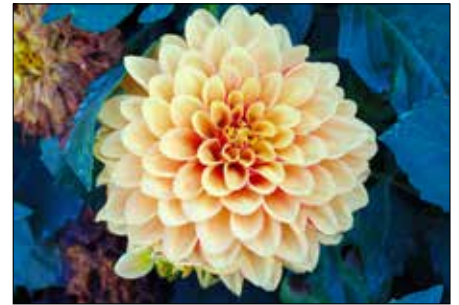
Many flowers display petal counts that align with Fibonacci numbers

The same can be said for the first part of the Lord's prayer: "Our Father which art in Heaven,..." Matthew 6:9. A father somewhere is the originator and progenitor of every living person on earth. No one ever came into existence by his or her own will. The great gift of life deserves to be deeply respected. Life is sacred. "Hallowed be Thy name" is