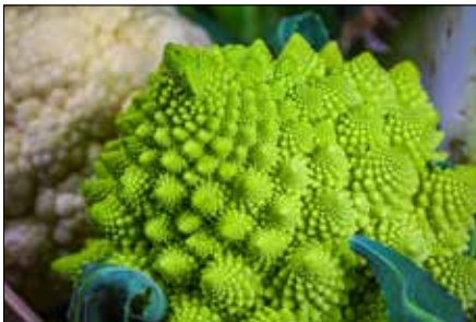
The number of spirals on the head of Romanesco broccoli is a Fibonacci number

But look at this: Man was created according to the Fibonacci sequence as well. For example, the distance from the tip of your fingers to the wrist is approximately two-thirds of the distance from your wrist to the back of your el-